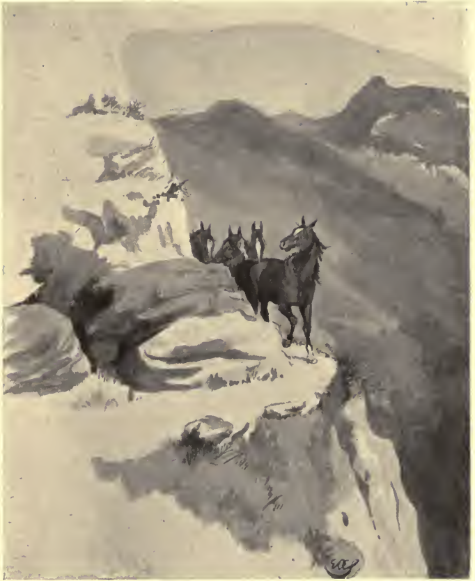
“Two or three startled, audacious pony faces peering round a pile of boulders.”